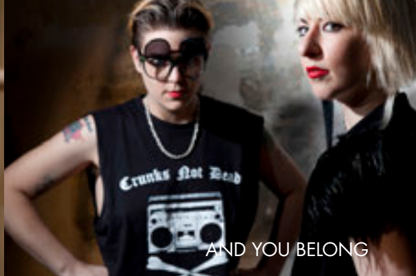
AND YOU BELONG