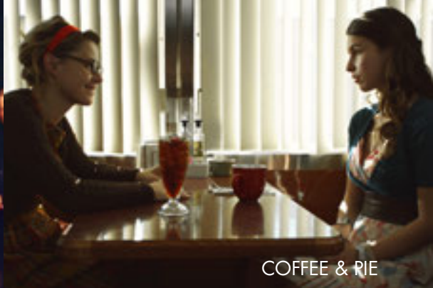
COFFEE & RIE

SCHOOL OF FRINGE! THE OLD CARDINAL POLE CATHOLIC SCHOOL, VICTORIA PARK ROAD, LONDON E9 7HD (between Banbury Road and Lammas Road)