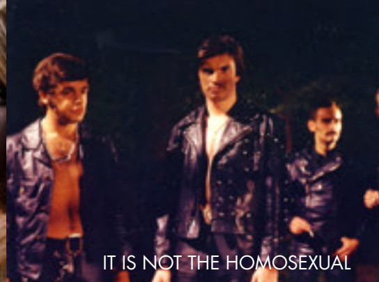
IT IS NOT THE HOMOSEXUAL