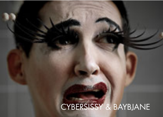
CYBERSISSY & BAYBJANE