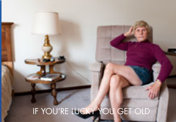
IF YOU'RE LUCKY YOU GET OLD